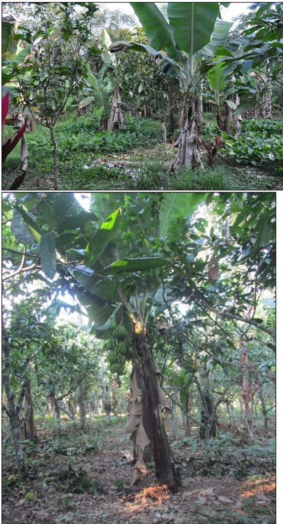
Fig. 3 Agroforestry system with pruning (AF) in 2016 (top) and 2023 (bottom)