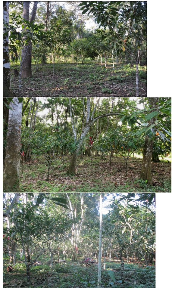
Fig. 4 Secondary forest with cleared understorey, where cocoa trees were planted and pruned (SFwP) in 2016 (top), 2020 (middle) and 2023 (bottom)