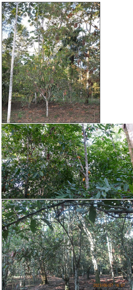
Fig. 5 Secondary forest with cleared understorey, where cocoa trees were planted but not pruned (SFnP) in 2016 (top), 2020 (middle) and 2023 (bottom)

Open Access This article is licensed under a Creative Commons Attribution 4.0 International License, which permits use, sharing, adaptation, distribution and reproduction in any medium or format, as long as you give appropriate credit to the original author(s) and the source, provide a link to the Creative Commons licence, and indicate if changes were made. The images or other third party material in this article are included